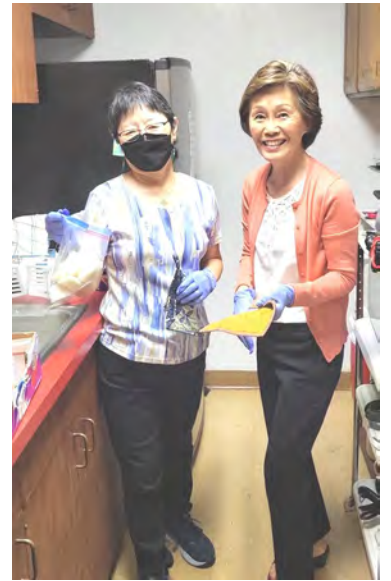
Zenzai courtesy of the BWA January 28th