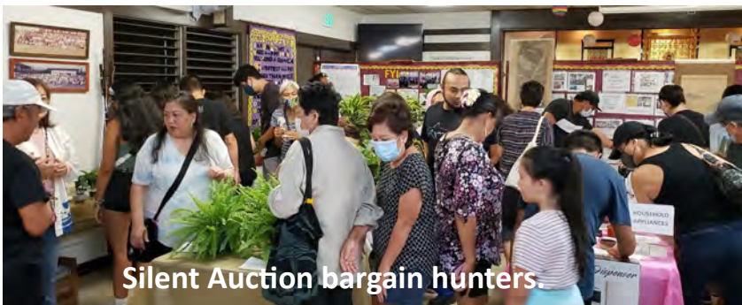
Silent Auction bargain hunters.