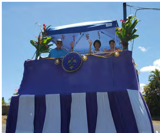
"I think we're finally done!"