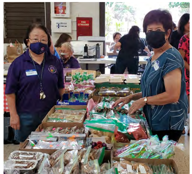
Baked goods galore!