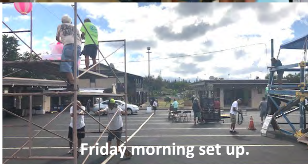
Friday morning set up.