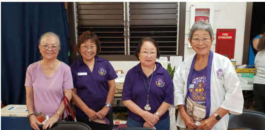
BWA Country Store: Service with a smile.