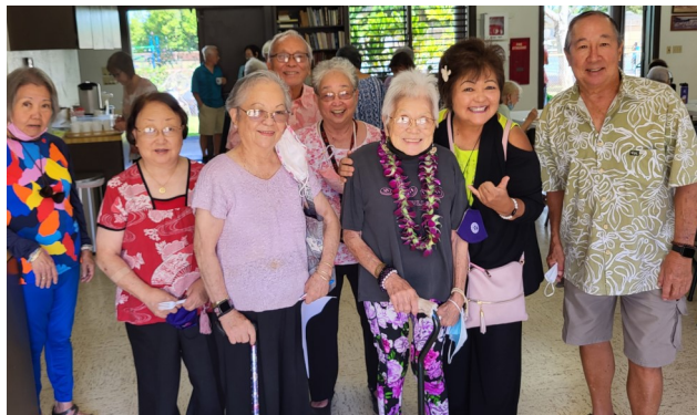
Fellowship following Sunday Service