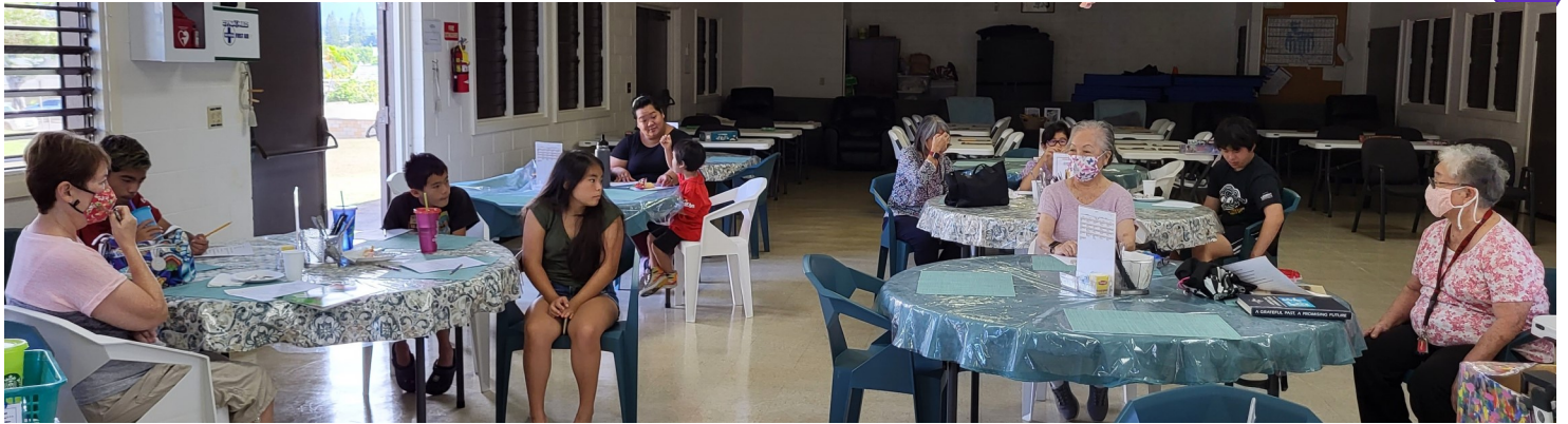
Dharma School students and Keirokai Honorees talk story.