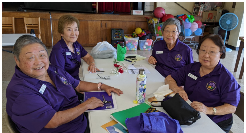
Mililani Hongwanji BWA at the Oahu United BWA Annual Conference at Aiea Hongwanji