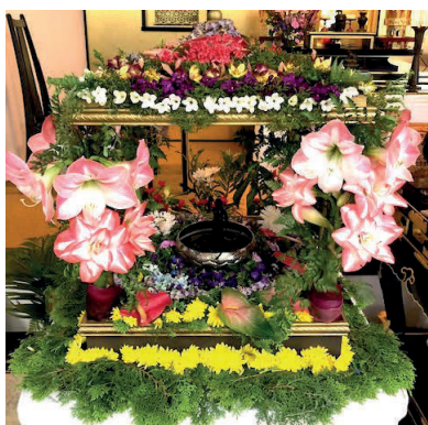
Hanamatsuri Buddha's Birthday April 9, 2023