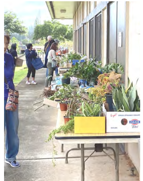
Plant Share - January 13th Next one: April 13th