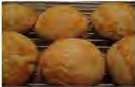
Manju: one order is 5 pc for $5

TEMPLE: _____ OR Delivery Address: _____