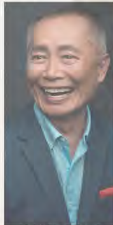
SPECIAL GUEST SPEAKER GEORGE TAKEI ACTOR/CIVIL RIGHTS ACTIVIST