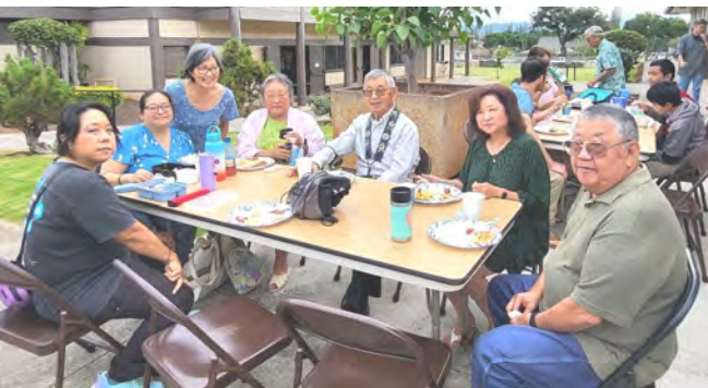
Sangha Breakfast prepared by Dharma School 'ohana - January 21st