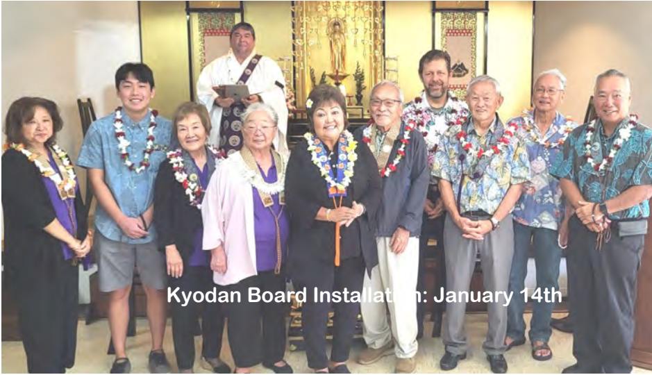
Kyodan Board Installation: January 14th