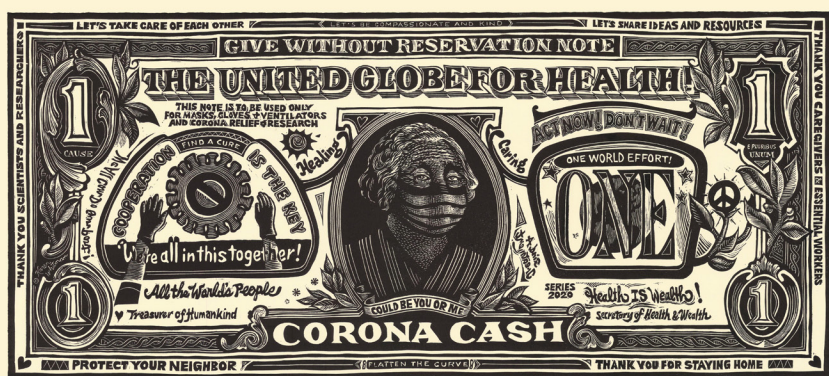
Karen Whitman, "Corona Cash," Linocut Image size, 10-1/2" x 23-3/4" Paper size is 16" x 29" Printed on Zerkall Book, Smooth (Cream) 2020 Ed. 150 $425. www.karenwhitman.net