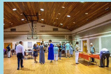
A Special Day, Indeed!