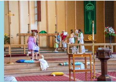
A children's message journey in Following Jesus