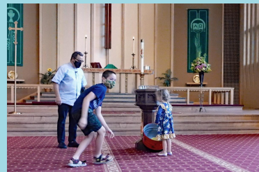
Add your caption here