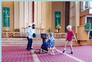
Collecting Noisy Offering