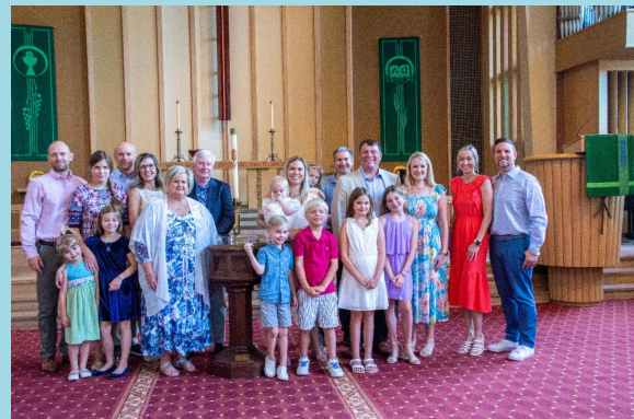
Harrison's Baptismal Entourage