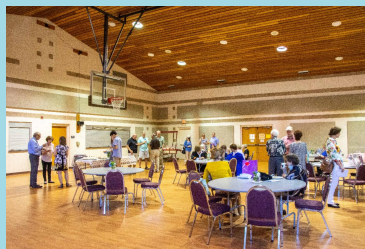
Thank you to the McCauley-Dielhl Circle for Reception