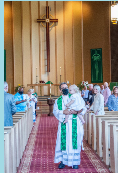
Welcome to the mission we share in Christ.