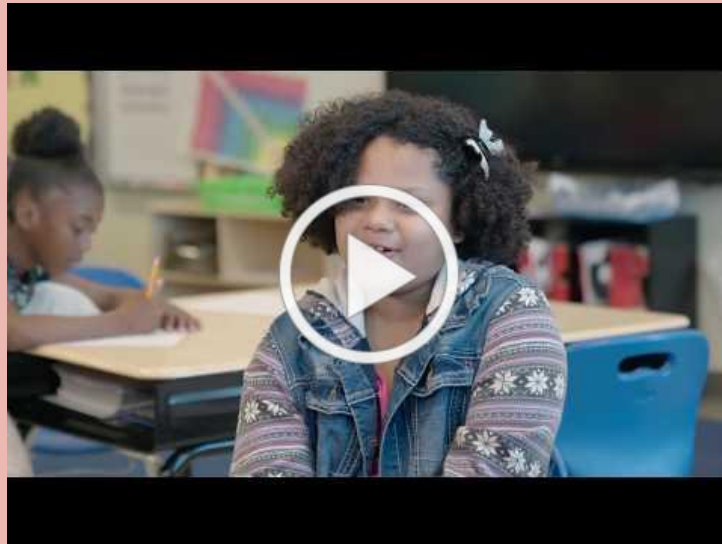
Classroom Central Introductory Video