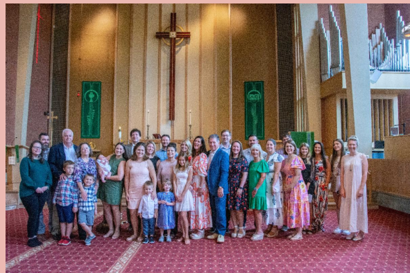
One big beautiful family, indeed!