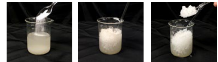
Add Liquid Lock to slurry liquid