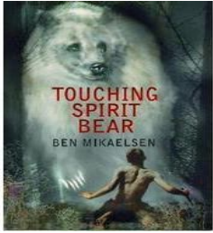
Touching Spirit Bear by Ben Mikaelson