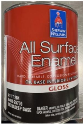
Verde Green Base Color to Tint A11 T 204 6403-25759 Ultra Deep Base