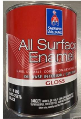
Black Base Coat A11 B 200 6403-25676 Black