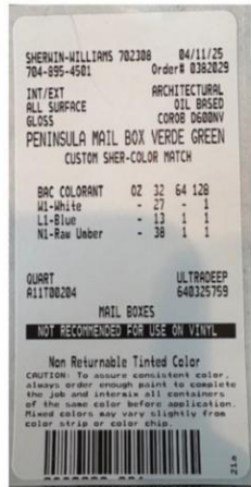
Verde Green Formula