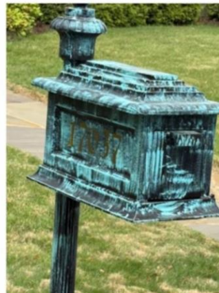
Incorrect Verde Green Patina Application