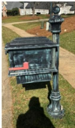
Correct Verde Green Patina Application