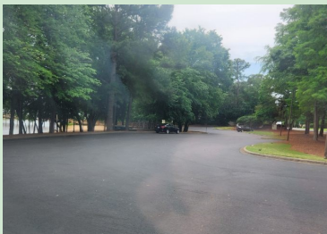
Photo on the left is the new pavement.

The parking lot at John Connor Road Park is newly re-paved and ready for Peninsula residents to enjoy!