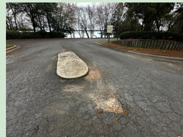
Photo on the right is the old entryway-- notice the cracked and worn asphalt.

In addition to the new pavement, the PPOA Board is making other changes to the John Connor Road Park.