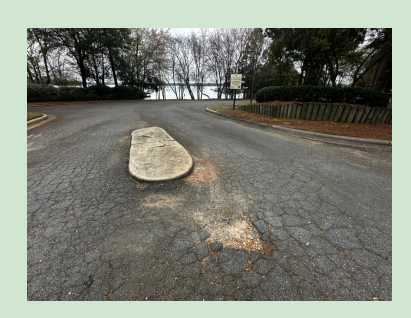
Photo on the right is the old entryway-- notice the cracked and worn asphalt.

In addition to the new pavement, the PPOA Board is making other changes to the John Connor Road Park.