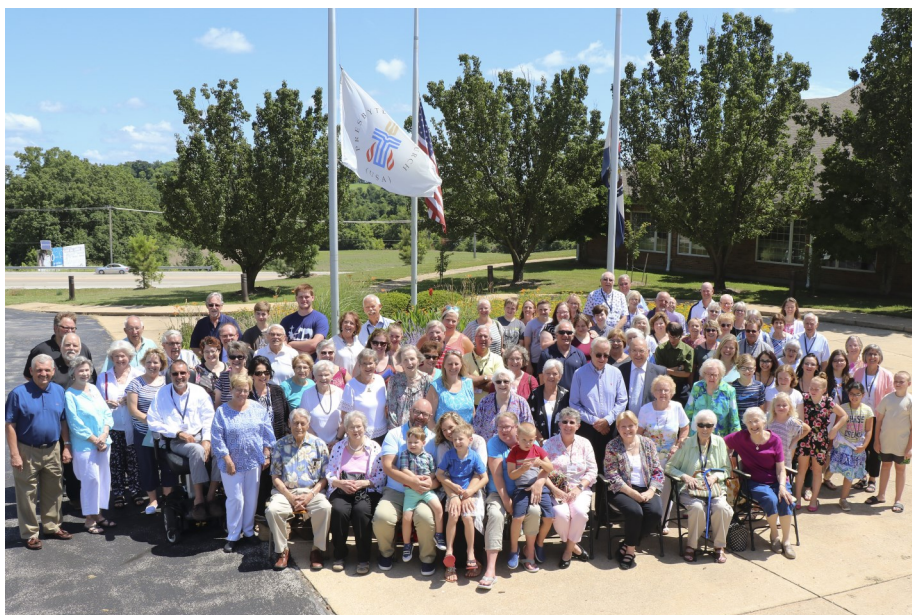
CONGREGATIONAL PHOTO TAKEN JULY 14, 2019

Presbyterian Church of Washington 4834 South Point Road Washington, MO 63090 636-239-3178 email: presby@yhti.net www.presbywashmo.org