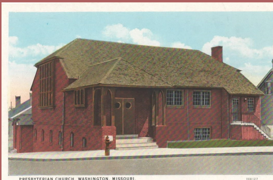
PRESBYTERIAN CHURCH, WASHINGTON, MISSOURI.