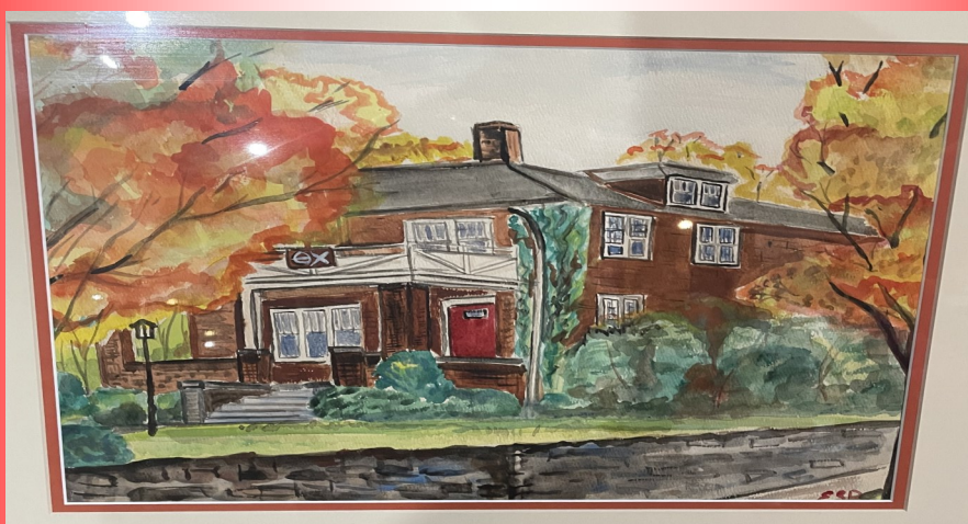
A drawing of the original Gamma Kappa Theta Chi house on College Ave.