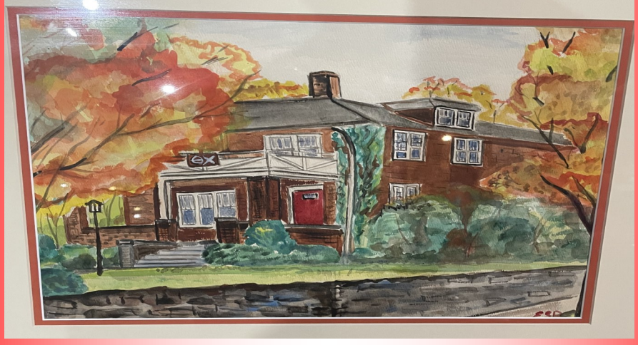
A drawing of the original Gamma Kappa Theta Chi house