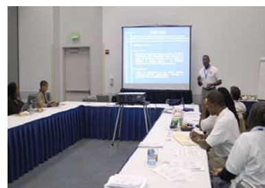
ALOM 2006, Anaheim, CA

information, please contact The Joshua Group at (404) 4559-6191.