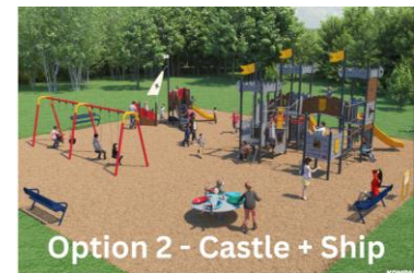
Option 2 - Castle + Ship