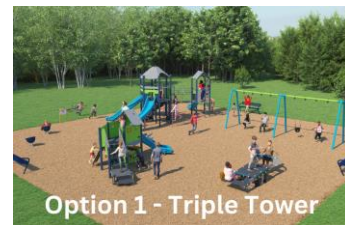
Option 1 - Triple Tower