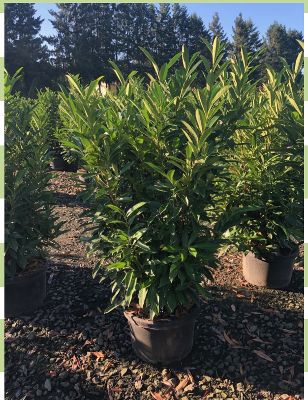
Prunus laurocerasus 'Schipkaensis' 10 gal

Slow growing with compact emerald-green foliage. One of the best arborvitae for screens, great winter color.