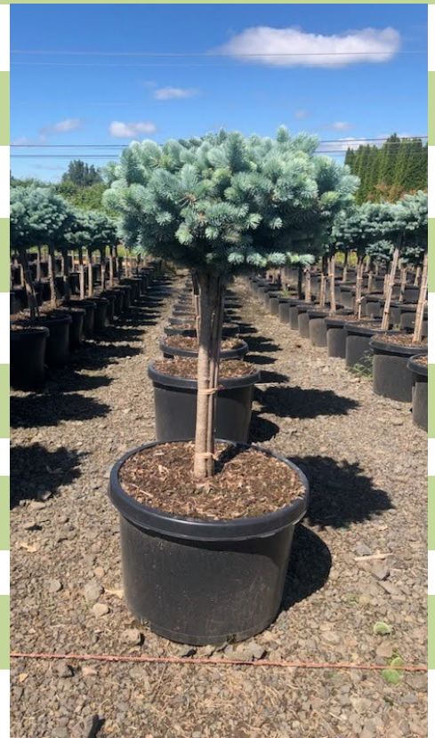
Picea pungens 'Globosa Nana' Std. 10 gal

Silver-blue evergreen foliage weeps gracefully downward while maintaining a central leader. Medium growth to 12' tall.