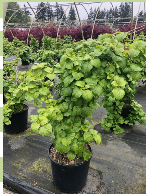
Hydrangea anomala subsp. 'Petiolaris' 3 gal

A very dense growth pattern reaching 3' to 5' tall and spreading 4' to 6' wide. Rich green evergreen foliage.