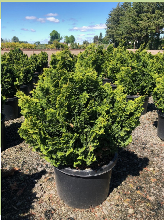
Chamaecyparis ob. 'Nana Gracilis' 10 gal

A slow growing upright, irregular form. Rich green color and dense habit.