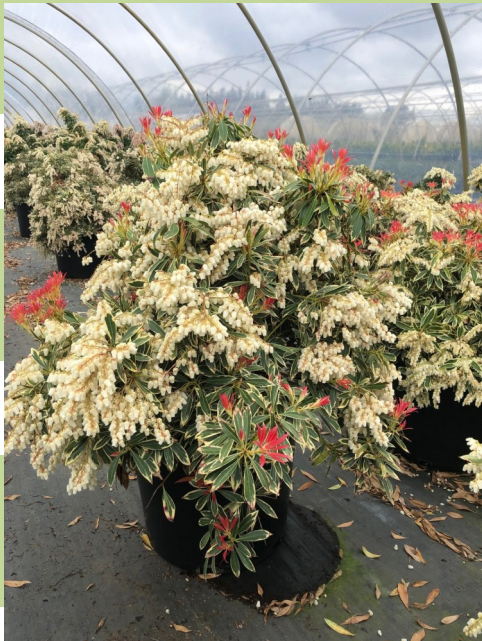
Pieris japonica 'Flaming Silver' 7 gal

Fiery red new growth matures to lustrous deep green foliage. Produces an abundance of white flowers. Dense, upright habit.