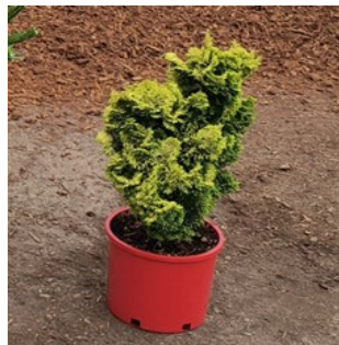
Cham. ob. 'Nana Lutea'