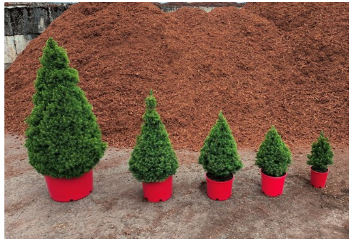
Picea glauca 'Conica' in #10, #5, #3, #2 and #1