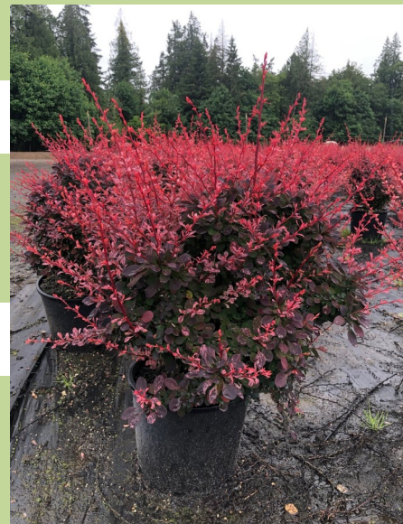
Berberis thunbergii var. atro. 'Rose Glow' 3 gal

The new foliage is a bronzy-red and pinkish-white, deepening to a rose and bronze. Plants will reach 4' to 6' in height and width.