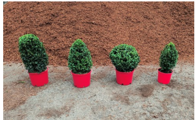
Buxus Topiary in cylinder, cone, globe and pyramid.