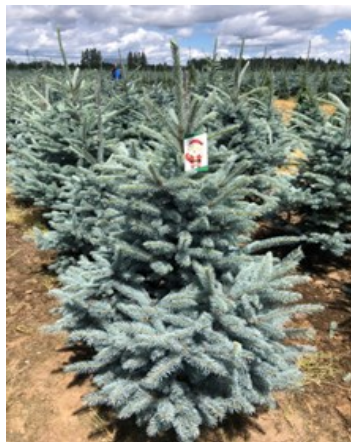
Picea pun. 'Baby Blue Eyes'