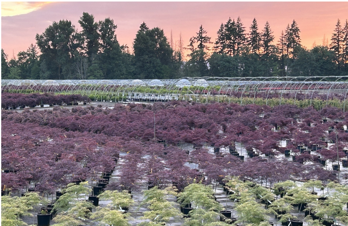
Japanese Maples 5 gal

Acer palmatum 'Bloodgood' 5 gal 10 gal 15 gal