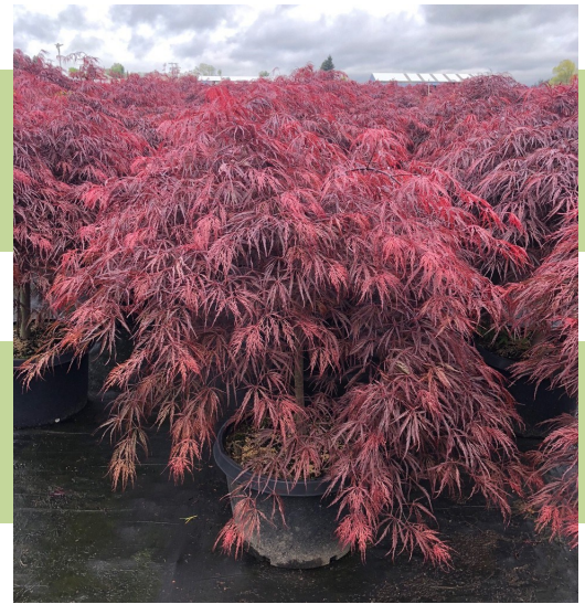
Acer palmatum diss. 'Crimson Queen' 10 gal

New foliage is a deep crimson-red turning to a dark purple-red. Strong, weeping habit, looks best in full sun.