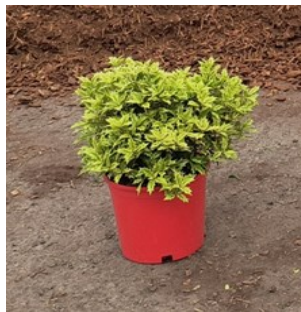
Osmanthus het. 'Goshiki'