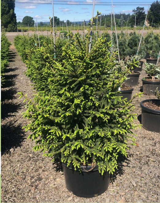
Picea orientalis 'Gowdy' 10 gal