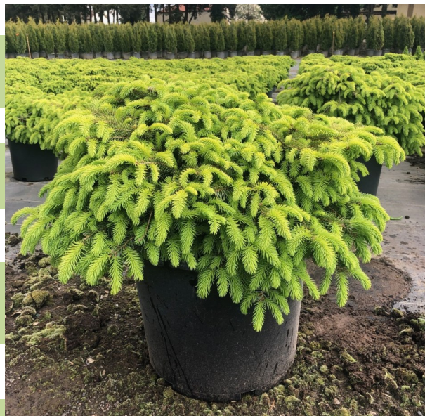
Picea abies 'Nidiformis' 7 gal