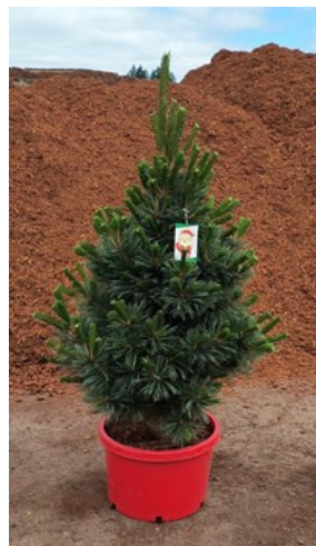
Pinus flex. 'Vanderwolf'