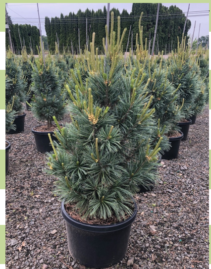
Pinus flexilis 'Vanderwolf's Pyramid' 10 gal

Graceful evergreen tree with bluish-green needles. Pyramidal habit. Produces numerous cones, even at a young age.