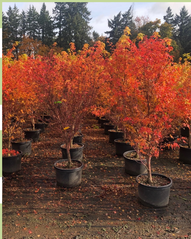
Acer Palmatum 'Sango Kaku' 10 gal

Upright grower with bright green foliage. The bright red stems of the plant are very showy in the winter.