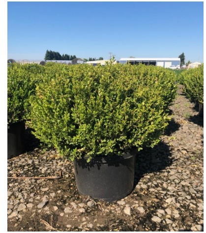
Buxus micro. 'Winter Gem' 24" CT

**We offer our field-grown boxwood in a hybrid containerized package. Plants are dug and placed in a nursery pot with soil media, a starter fertilizer with minors, and a slow-release fertilizer incorporated for immediate ship. Plants are denoted below with a minimum height (or width) and the code "CT." We have found this package is popular with landscapers and garden centers alike!**