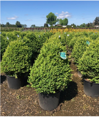
Buxus hybrid 'Green Mountain' 24" CT