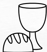
Communion shared 24 times