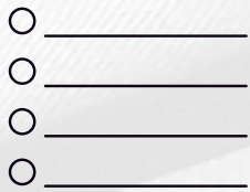
A Weekly Prayer List is available

Only when we spend time with God in prayer are we spiritually prepared to offer ourselves to others. All that is required to begin is to make a conscious effort to spend time with our God. At New Beginnings, prayer opportunities abound, offering a variety of prayer-centered experiences throughout the year in addition to a time of prayer as part of every worship service.