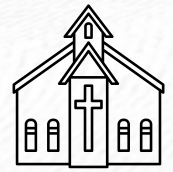
56 Services of Worship offered