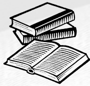
"A Praying Congregation" class was offered