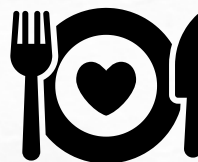
4 fellowship meals shared