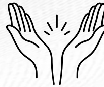
An Altar Prayer team is available