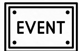
Over 260 events offered