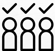
107 in-person average attendance

So much of discipleship is showing up! Being present for worship weekly links us and strengthens bonds in our congregation. However, The United Methodist pledge to be present goes beyond Sunday morning. Being present means being an active part of the body, both through Sunday's services and throughout the week.