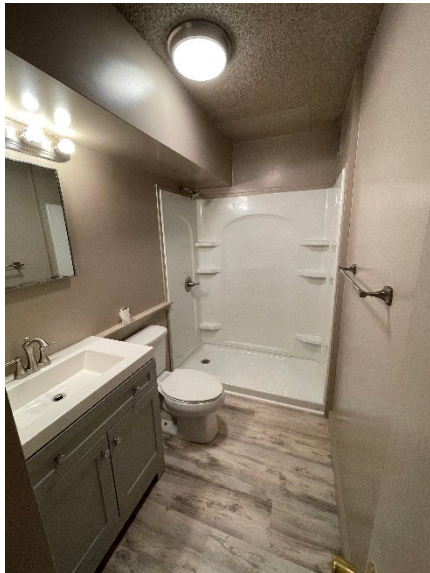
Recent Bathroom Remodel