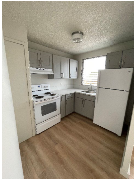
2-Bed Kitchen Area