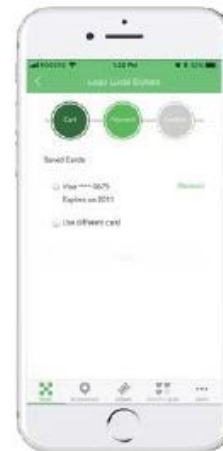
Select saved card on file