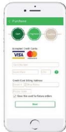
Enter credit card number