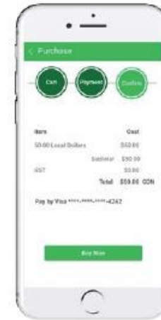
Checkout screen confirmation