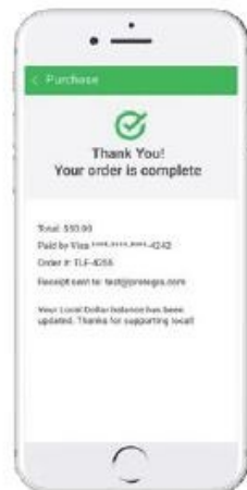
Local Dollar purchase receipt is emailed