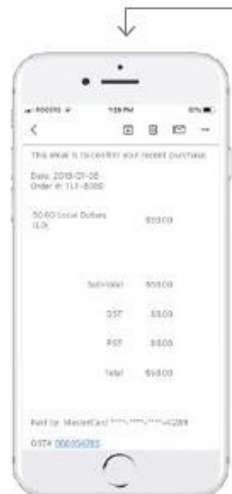
Order is complete.