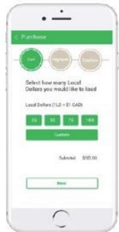
Select amount to load