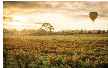
Ballooning over the Barossa