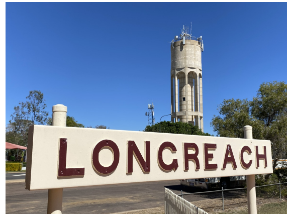
Welcome to Longreach