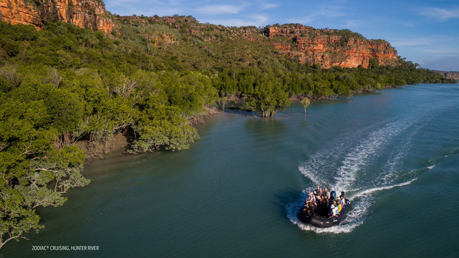
ZODIAC® CRUISING, HUNTER RIVER