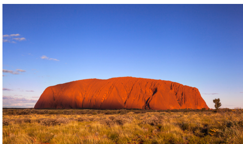
Uluru & the Red Centre