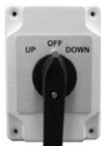
EXISTING (ACI) SWITCH