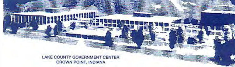
LAKE COUNTY GOVERNMENT CENTER CROWN POINT, INDIANA

LAKE COUNTY GOVERNMENT CENTER 2293 NORTH MAIN STREET CROWN POINT, INDIANA 46307 219-755-3280 FAX: 219-755-3283