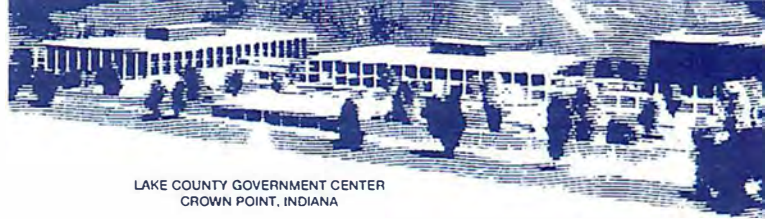
LAKE COUNTY GOVERNMENT CENTER CROWN POINT, INDIANA

LAKE COUNTY GOVERNMENT CENTER 2293 NORTH MAIN STREET CROWN POINT, INDIANA 46307 219-755-3280 FAX: 219-755-3283