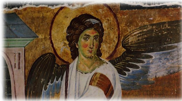
White angel fresco

After breakfast drive to Uvac Nature Preserve , and ride in off road vehicles to the viewpoint “Molitva”. There you will see the Griffin vultures, an endangered species common to this area. Welcome by local villager who makes homemade honey and cheese. Drive to Prijepolje. Lunch along Lim River with beautiful view. Visit Mileseva Monastery , well known by White Angel Fresco. Founded in 13 th century. Local lunch. Drive to Montenegro, Zabljak town, located in Durmitor National Park . Dinner, overnight.