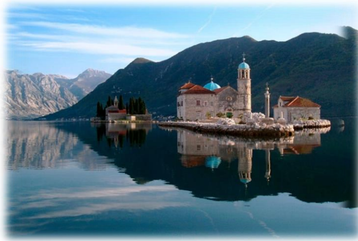
Lady On the Rock – Kotor Bay

After breakfast drive to Kotor , UNESCO town museum and sightseeing. Walk through historical downtown Kotor. Drive along the most beautiful fjord in the Adriatic Sea to Perast and Risan towns, both UNESCO heritage site. Boat ride to Holy Virgin on the Rocks Church, situated on an island in the bay of Kotor and sightseeing. Lunch. Drive to Trebinje . Hotel accommodation. Overnight.