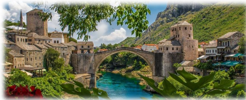
Mostar – Old bridge

After breakfast drive to Tvrđos Monastery and Nova Gracanica Church where Jovan Ducic is buried. Lunch with traditional cuisine. We then continue our drive to Mostar, the most beautiful town in Bosnia and Herzegovina. Sightseeing of Mostar. Visit Blagaj village, situated at the spring of Buna River and historical tekke (Dervish Monastery) – OPTIONAL. Hotel accommodation. Dinner. Overnight.