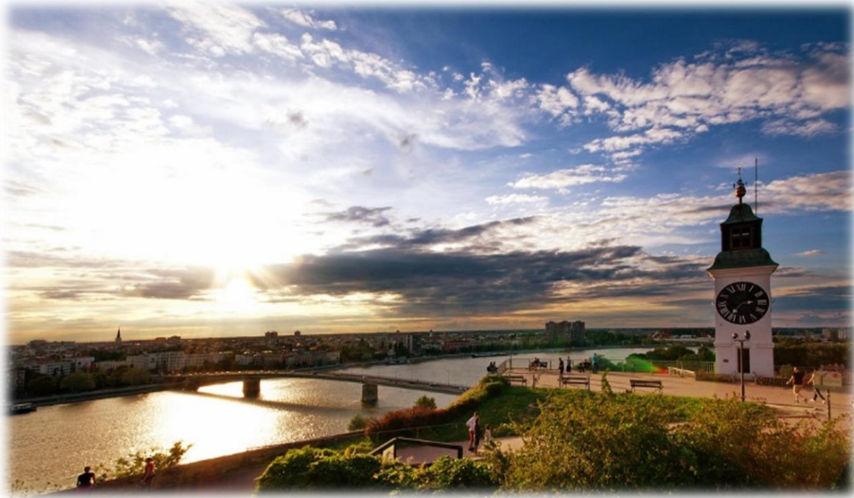
Petrovaradin Fortress Novi Sad

After breakfast drive to Sremski Karlovci , the spiritual and cultural center of the Serbs during the Austria-Hungary Empire. Walk through beautiful baroque center and pedestrian area of Sremski Karlovci – Patriarchal Residence, Saint Nicholas Church, Gymnasium and Four Lions Fountain. Drive along the slopes of Fruska Gora, visit Krusedol Monastery (optional Grgeteg Monastery), one of the 17 Medieval Monasteries in Fruska Gora. Traditional cuisine lunch. Drive to Petrovaradin Fortress , military fortification along Danube River. Back to the hotel. Free time in Novi Sad and farwell dinner. Overnight.