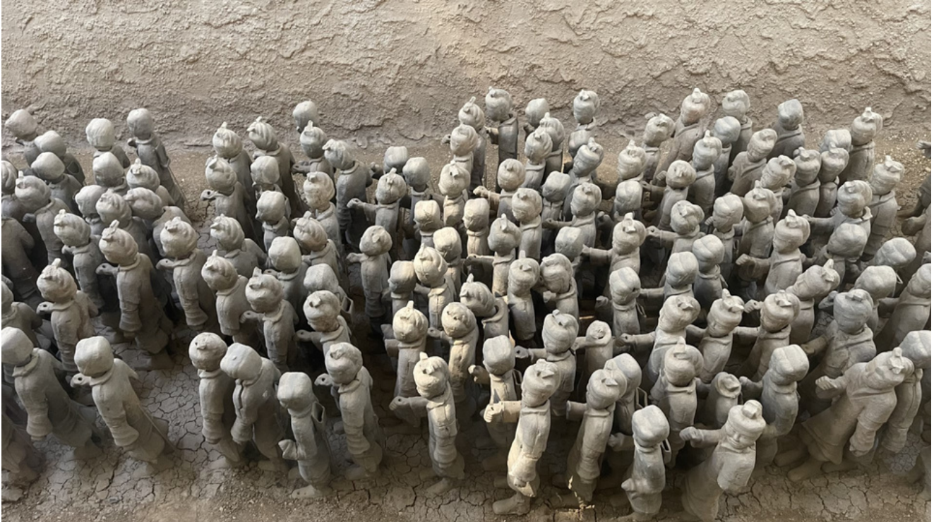
Image of a historical project: China's only known terracotta army from the Han dynasty (206 BCE-220 CE). Xuzhou Museum of Terracotta Warriors and Horses of Han Dynasty. Xuzhou, China.