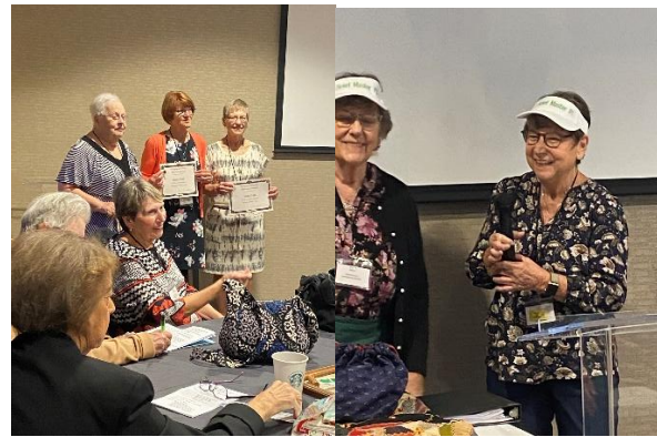
50 Year Members