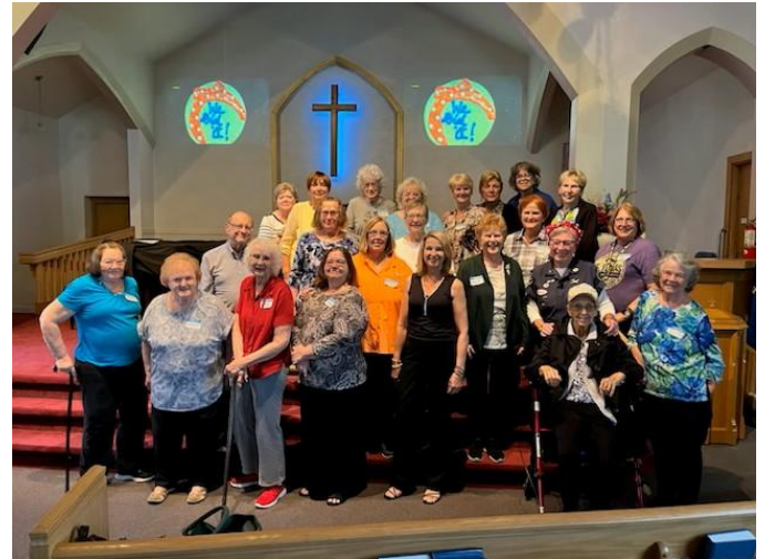
Southeast members attending their District Mtg sponsored by Wayne County in May 2024.

Wayne County Five members did go to State Convention. Things that their group have been doing, Car Show, Valentine Veterans Day, Ladies Tea, Woman Dinner, and they help with Rummage Sale. In October they will helping with Trunk & Trick & Treat.