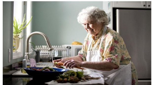
Old Farmers Almanac Household Tips & Tricks

You love to eat fish but can't stand the smell of it in the kitchen once it's been cooked. Simmer a pan of water on the stove with spices such as whole cloves, cinnamon sticks, or allspice, or cut up a lemon and simmer the slices in a pan of water.