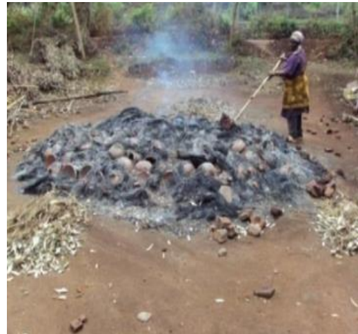
Plate14: Firing and Length of firing. It takes 15- 20 minutes for the pot to be achieved the desired level