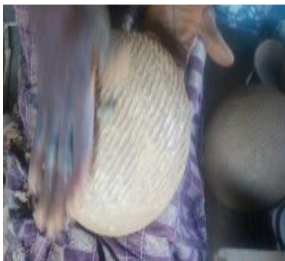
Plate 8: Shell for designing the rims. Plate9: potter's designing pot with rope roulette