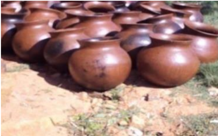
Plate17: Painted pots

After drying the pots are kept under the tree shade to enable it dry