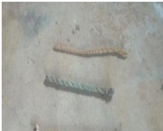
Plate6: Rope for roulette