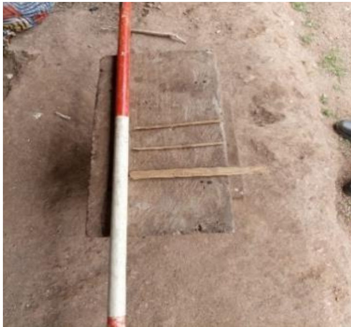
Plate5: Bamboo's sly for design