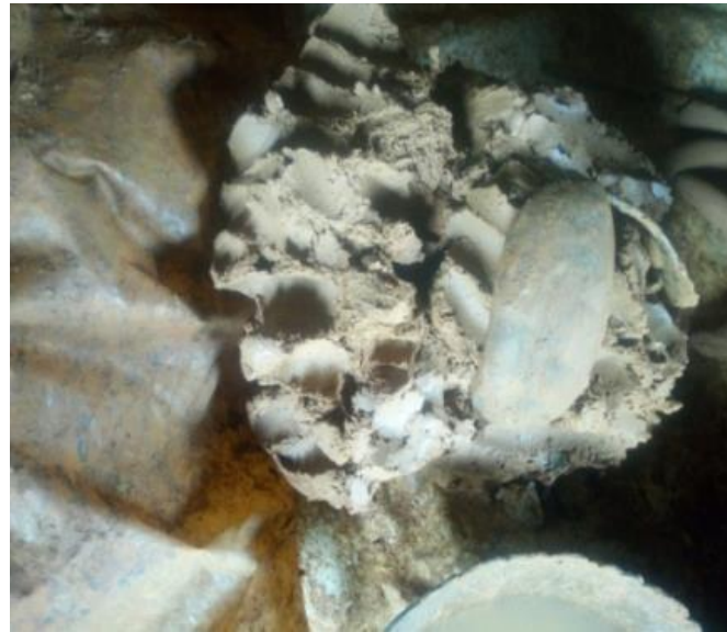
Plate2: Clay preparation