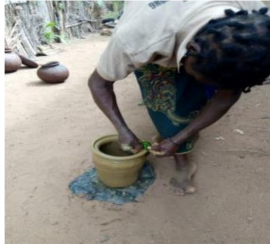
plate4: Formation of vessel