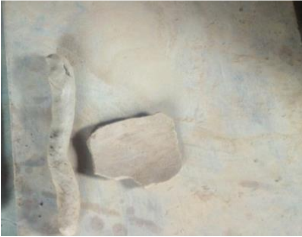
Plate3: Formation process