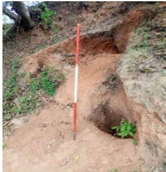
Plate1: Clay acquisition