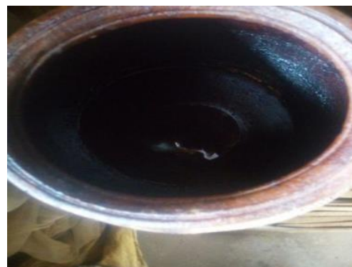
Plate15:1 Unprepared colour