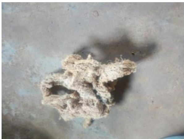
plate7: Old sack for smooth design