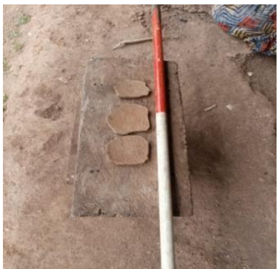
Plate10: Pieces of potsherd during reconnaissance