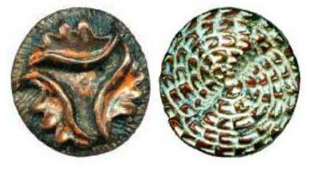
NOTE SAW/GRINDING MARKS, VERTICAL HOLE & BUBBLE

I've found quite a few of these from vintage collections on cards of plaster or wood compositions of the ANN and GAP types. Some of them have a similar look and could be mistaken for those materials at first glance. And, some of these buttons are truly outstanding in design and beauty and have great subject matter, which any collector would be proud to add to their collection.