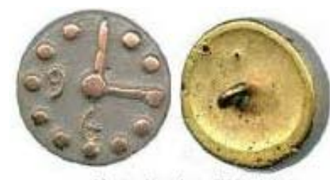
Note Broken Bubbles