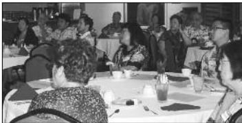
Participants that joined the 6th APC Luncheon Lecture, Fall 2013.