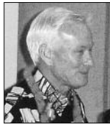
Mayor Kirk Caldwell