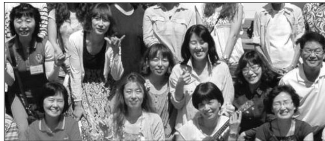
Participants from Summer 2013

The Center for Asia Pacific Exchange completed 23 workshops, lecture series, and seminars in 2013, hosting 500 participants from China, Japan, Korea, the Philippines and the United States. With our aim of increasing participants' international cultural understanding, developing their professionalism and English language skills, and providing visitors and hosts alike with the opportunity to engage in international exchange and cooperation, CAPE has continued its work in