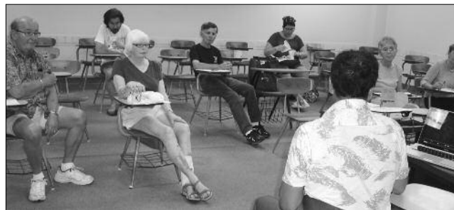
Participants from various professional and academic disciplines joined CAPE at the 24th Language & Culture Seminar, Fall 2013