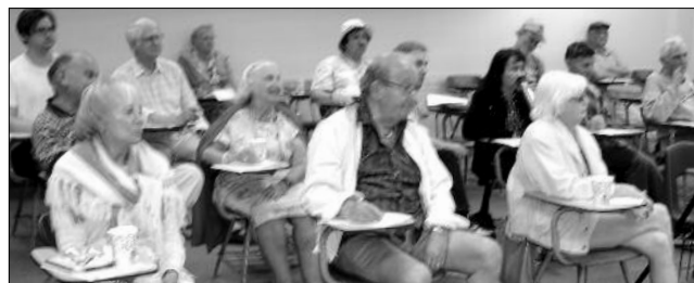
Participants from various professional and academic disciplines joined CAPE at the 28th Annual Asia Today Series, Spring 2014