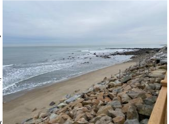
Ocean Bluff beach January 20, 2021

OBPA, P.O. Box 2078 % Helen Mahon, Ocean Bluff, MA 02065