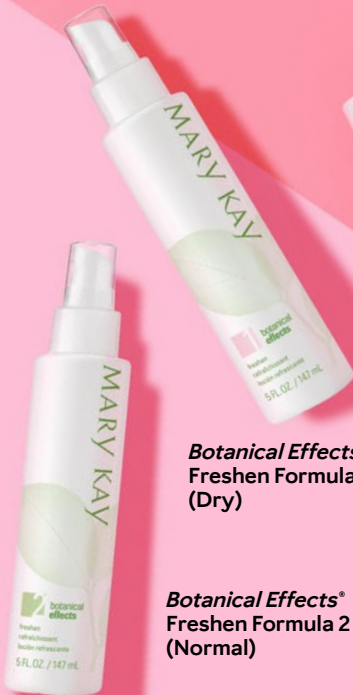
Botanical Effects® Freshen Formula 1 (Dry)

After exfoliating, wipe away traces of makeup, oil or dirt with a toner that helps refresh skin and restore a healthy-looking complexion. Use morning and night, before moisturizer.