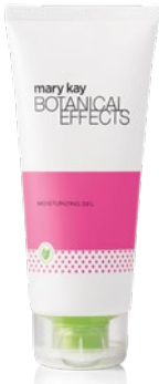
Botanical Effects® Hydrate Formula 1 (Dry) Moisturizing Gel