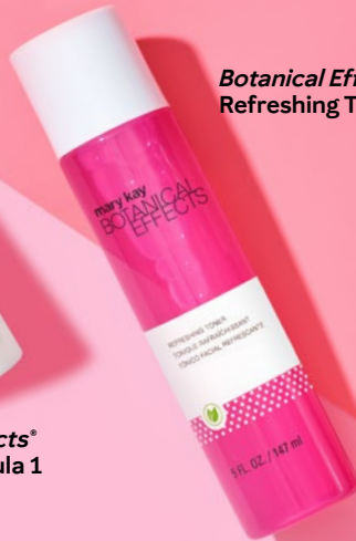
Botanical Effects® Refreshing Toner