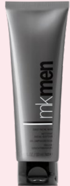
MKMen ® Daily Facial Wash