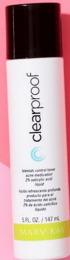
Clear Proof® Blemish Control Toner*