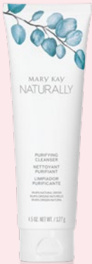
Mary Kay Naturally ® Purifying Cleanser