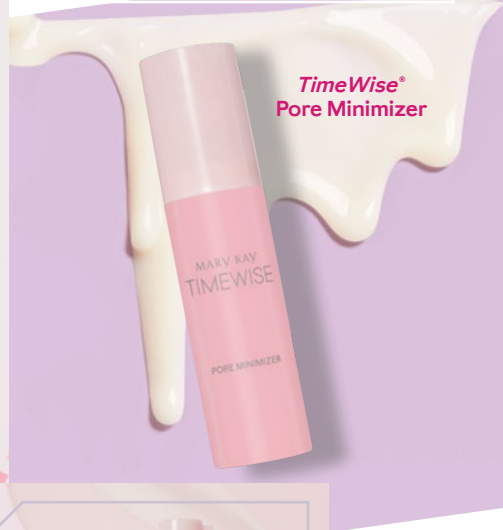
TimeWise® Pore Minimizer