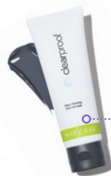
Clear Proof® Deep-Cleansing Charcoal Mask