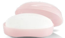
TimeWise ® 3-in-1 Cleansing Bar (with soap dish)