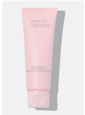
TimeWise® Age Minimize 3D® Day Cream SPF 30 Broad Spectrum Sunscreen*