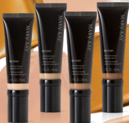
Mary Kay® CC Cream Sunscreen Broad Spectrum SPF 15*