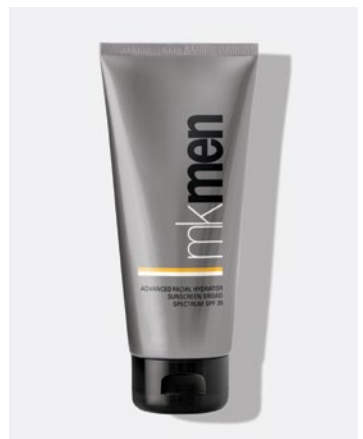
MKMen® Advanced Facial Hydrator Sunscreen Broad Spectrum SPF 30*