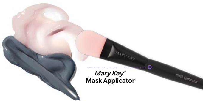
Mary Kay® Mask Applicator