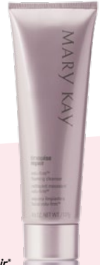
TimeWise Repair ® Volu-Firm ® Foaming Cleanser