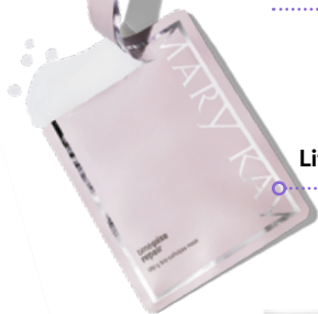
TimeWise Repair® Lifting Bio-Cellulose Mask