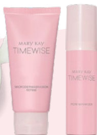
TimeWise® Microdermabrasion Plus Set