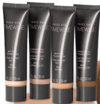
TimeWise® Matte 3D Foundation