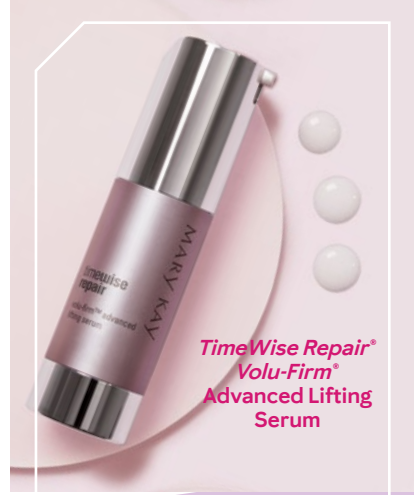
TimeWise Repair® Volu-Firm® Advanced Lifting Serum