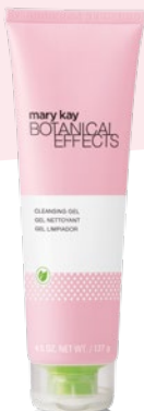
Botanical Effects ® Cleansing Gel