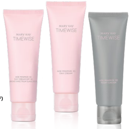
TimeWise® Age Minimize 3D® Night Cream