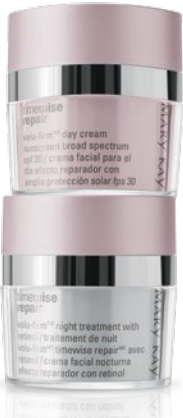
TimeWise Repair® Volu-Firm® Night Treatment With Retinol