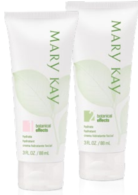
Botanical Effects® Hydrate Formula 1 (Dry)