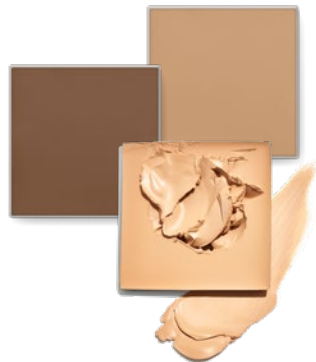
Endless Performance® Crème-to-Powder Foundation