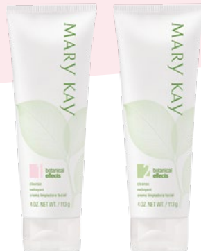
Botanical Effects ® Cleanse Formula 1 (Dry) Botanical Effects ® Cleanse Formula 2 (Normal)