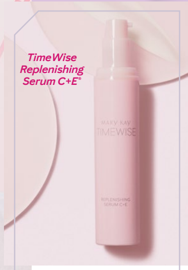
TimeWise Replenishing Serum C+E®