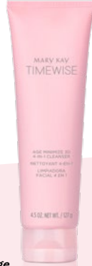
TimeWise ® Age Minimize 3D ® 4-in-1 Cleanser