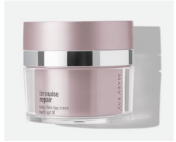
TimeWise Repair® Volu-Firm® Day Cream Sunscreen Broad Spectrum SPF 30*