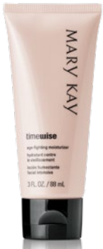
TimeWise® Age-Fighting Moisturizer