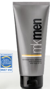
MKMen® Advanced Facial Hydrator Sunscreen Broad Spectrum SPF 30*