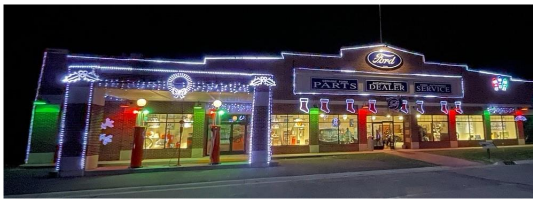
Night photo of the Model A Museum decked out for the holidays at Hickory Corners, MI (part of the Gilmore Auto Museum)