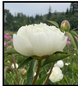
Name: Duchesse de Nemours Color: White Flower: Double/Bomb Bloom: Mid-season