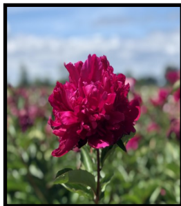
Name: Kansas Color: Red Flower: Double Bloom: Mid-season