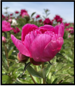
Name: Barbara Color: Bright pink Flower: Double/Bomb Bloom: Mid-season