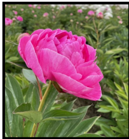
Name: Dr. Alexander Fleming Color: Pink Flower: Double Bloom: Late