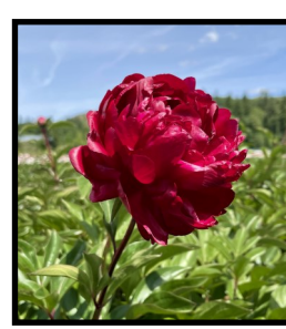
Name: Red Magic Color: True Red Flower: Double Bloom: Mid-season