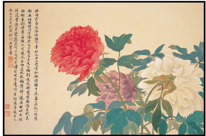
Peonies By Yun Shouping, 17th Century

Peonies have captivated our hearts from the very beginning. China's earliest history records its use in teas and to flavor food; Confucius was even noted to have said "I eat nothing without its sauce. I enjoy it very much, because of its flavor."