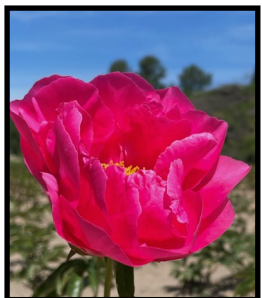
Name: Paula Fay Color: Bright Pink Flower: Single Bloom: Very Early