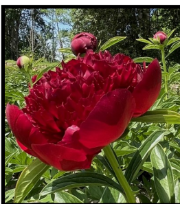
Name: Red Charm Color: True Red Flower: Double/Bomb Bloom: Very Early