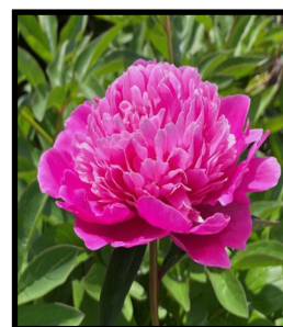
Name: Pink Pompadour Color: Med. Pink Flower: Double/Bomb Bloom: Mid-season