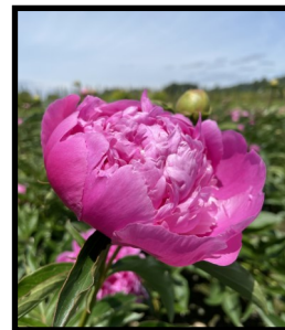
Name: Monsieur Jules Elie Color: Med. Pink Flower: Double/Bomb Bloom: Mid-season