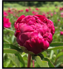
Name: Big Ben Color: Red Flower: Double Bloom: Mid-season