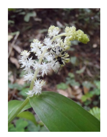
Maianthemum racemosum

False Solomon's seal ( Maianthemum racemosum ) was very lush and had white flowers. Its stamens are longer than the petals. The Jepson Manual prefers the common name false lily-of-the-valley, which I have never heard it called.