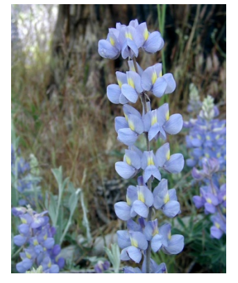
-Lupinus grayi-©2009 Barry Breckling

On May 26 we drove up to Indian Pools. It looked bad—flowers were replaced by big patches of snow. The parking lot at the trail head was surrounded by mounds of snow, the creek overflowed with rushing water, and water covered the trail. Then we went even higher to Rancheria Falls. The road was closed and ice water ran down the entire road. The group, tired of my howling and whining about the lack of flowers, turned around, and we ended up at 9S47 again. The temperature was great there. There were lots of flowers alongside the road, as well as above and below us.