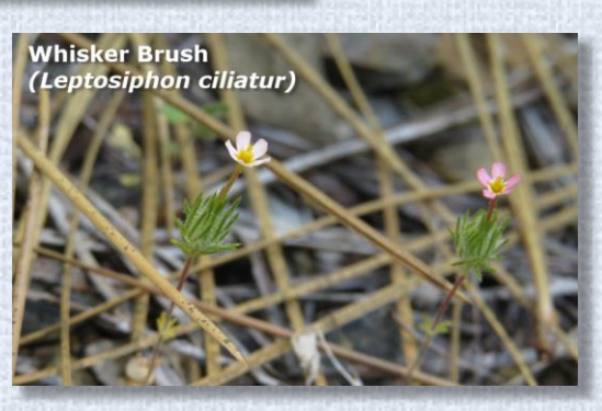
All photos (except Clarkia) taken near Big Creek (near Huntington Lake - elevation approx 5,000 feet)