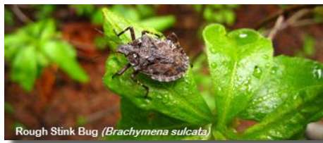
Rough Stink Bug ( Brachymena sulcata )