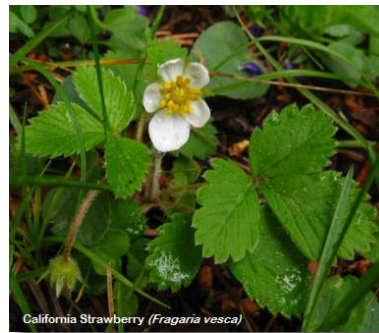
California Strawberry ( Fragaria vesca )