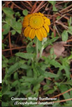
Common Woolly Sunflower ( Eriophyllum lanatum )