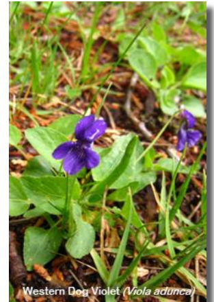
Western Dog Violet ( Viola adunca )