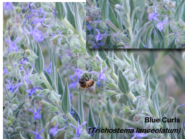
Blue Curls ( Trichostema lanceolatum )