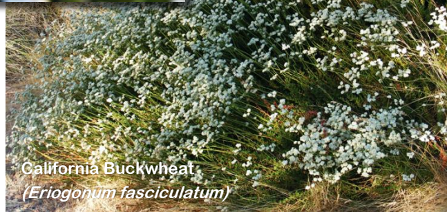
California Buckwheat ( Eriogonum fasciculatum )