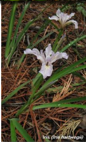
Iris ( Iris hartwegii )