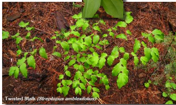
Twisted Stalk ( Streptopus amplexifolius )