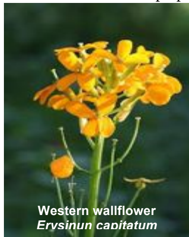
Western wallflower Erysimum capitatum

It's the hot, dry, dormant time of year when life seems to move in slow motion. The gift of the California natives is their adaptation to this season