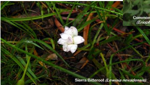
Sierra Bitterroot ( Lewisia nevadensis )