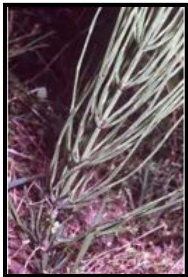
Marestalk Equisetum arvense

We also flagged a number of Valley Oak seedlings to be caged later to protect them from the cattle.