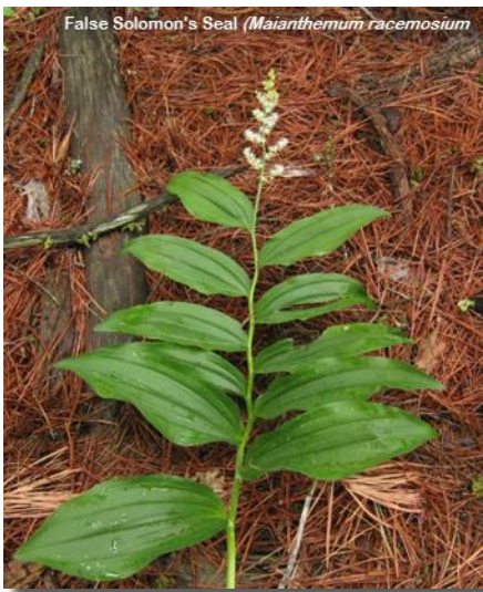
False Solomon's Seal ( Maianthemum racemosum )