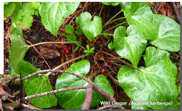
Wild Ginger ( Asarum hartwegii )