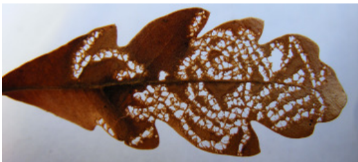
Blue Oak ( Quercus douglasii ) leaf and acorn