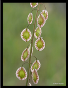
Fringe pod T. curvipes

pulchella . Large patches of western meadow-rue ( Enemion occidentale , nee Isopyrum o. ) had pink flowers. In other places I have only seen 1 or 2 clumps of Enemion , some with white flowers. Five or 6 elfin saddle fungi, 2" diameter little black brains, were scattered along on the hike. Near the end of the fairly level dirt road, there were several delicate plants about 4" tall with tiny white flowers. We had never seen anything like them and were trying to figure out what they were. Finally, I noticed a tiny seed