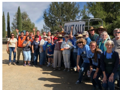
-CNPS and CBG volunteer group-

Repeating last year's layout, CNPS plant tables were interspersed with CBG tables to help customers locate similar plants (i.e. all the salvias, both native and non-native, were in the same area). Shoppers purchased 506 native plants from CNPS, which included 14 member-supplied plants (thanks to Chris and John for bringing anemopsis and elderberries). While CNPS sold more plants than in any year since 2015, our net earnings were lower than in previous years, likely due to selling more of the lower priced 4-inch pots; a reminder that member-grown plants represent "pure profit" for CNPS and are most welcome for next year's sale. We also signed up four new chapter members.