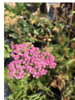
Left: Achillea millefolium 'Pink Island Form' yarrow