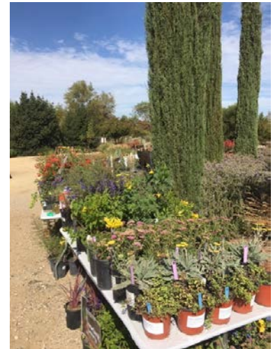
-a CBG table-

Repeating last year's layout, CNPS plant tables were interspersed with CBG tables to help customers locate similar plants (i.e. all the salvias, both native and non-native, were in the same area). Shoppers purchased 506 native plants from CNPS, which included 14 member-supplied plants (thanks to Chris and John for bringing anemopsis and elderberries). While CNPS sold more plants than in any year since 2015, our net earnings were lower than in previous years, likely due to selling more of the lower priced 4-inch pots; a reminder that member-grown plants represent "pure profit" for CNPS and are most welcome for next year's sale. We also signed up four new chapter members.