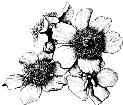
Tree of Heaven ( Ailanthus altissima )