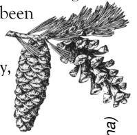
Foxtail Pine (Pinus balfouriana)