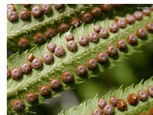
- Polystichum munitum

At Long Meadow Creek we ate lunch. Then Aaron explored while Eileen and I looked at plants, which included: red osier dogwood ( Cornus sericea ssp. sericea ) with bright red-purple twigs and round white drupes, Rocky Mountain ash or Cascade mountain ash ( Sorbus scopulina ) with globose orange fruit, western sword fern ( Polystichum munitum ), Pacific willow ( Salix lasiandra [ lucida ] var. lasiandra ) with wart-like glands at the petiole summit, and submerged shining pondweed ( Potamogeton illinoensis ).