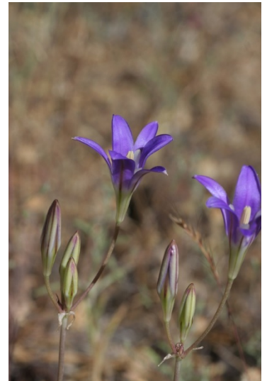
Brodiaea elegans

Monocots already in my garden are harvest brodiaea ( Brodiaea elegans ), both in the ground and potted, and Ithuriel's spear ( Triteleia laxa ) in pots.