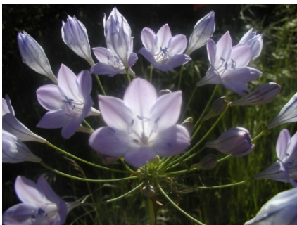
Triteleia laxa