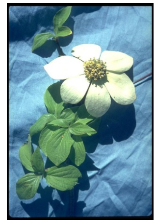
- Cornus nuttallii