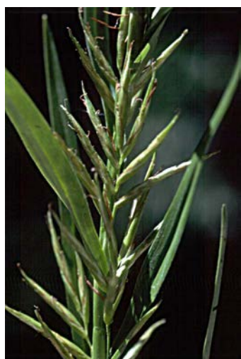
- Dulichium arundinaceum

We continued on to a large pond where we identified three way sedge ( Dulichium arundinaceum ) with stout, hollow, ROUND stems, the cow-lily or yellow pond-lily ( Nuphar polysepala [ lutea ]), which has a genus name of Arabic origin, and tules ( Schoenoplectus spp.) on the other side of the pond. We dug common bladderwort ( Utricularia macrorhiza ) out of the brown gunk at the bottom of the pond. A switchback road was at the far end of the pond. We walked to the crest of the hill and climbed onto granite where we were treated to a view of Wishon Dam to the northeast. Crevices in the granite contained Sierra stonecrop ( Sedum obtusatum ).