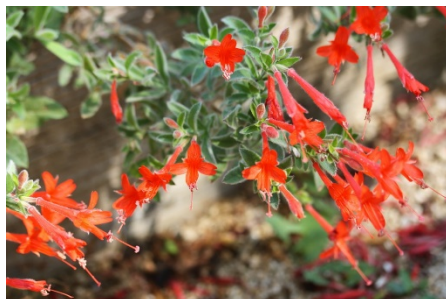
- Epilobium canum - ©2011 Kelly D. Norris

On a recent trip to the Shaver Lake area we saw a brilliant red-orange display of California fuchsia ( Epilobium canum ) at the 2000 foot level, redbud ( Cercis occidentalis ) showing coppery leaves farther up, and a gorgeous variety of pinks, oranges, and reds above the four-lane as we got into the dogwoods ( Cornus sp.), along with lovely gold leaves on the black oaks ( Quercus kelloggii ). All these nice colors provide some welcome distraction from the tragic dull russet of countless dead conifers.