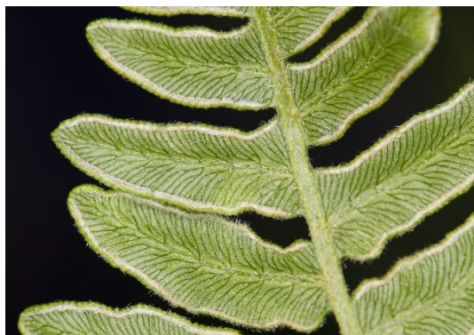
- Pteridium aquilinum var. pubescens

past the PG&E housing area and just before Lily Pad Pond (covered with yellow pond-lilies). A short distance in, the road splits 3 ways—we took the middle, unmarked one. Beneath the housing we were shocked, since there