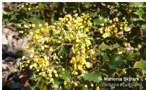
Mahonia Skylark ( Berberis aquifolium )