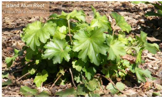
Island Alum Root ( Heuchera maxima )