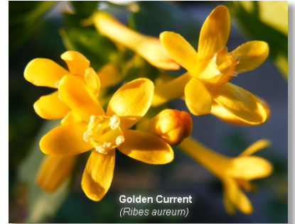
Golden Currant ( Ribes aureum )