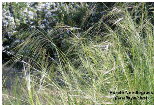
Purple Needlegrass ( Nasella pulchra )