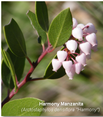
Harmony Manzanita ( Arctostaphylos densiflora "Harmony")