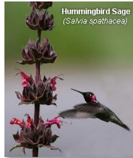
Hummingbird Sage ( Salvia spathacea )