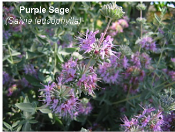
Purple Sage ( Salvia leucophylla )