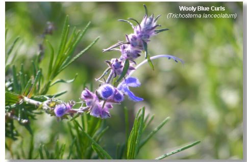
Woolly Blue Curlew ( Trichostema lanceolatum )