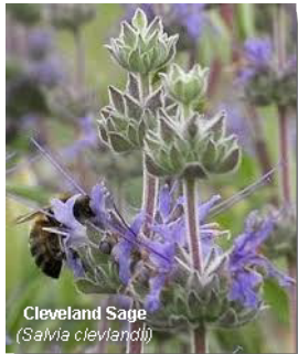
Cleveland Sage ( Salvia clevelandii )