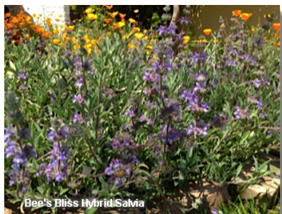
Bee's Bliss Hybrid Salvia