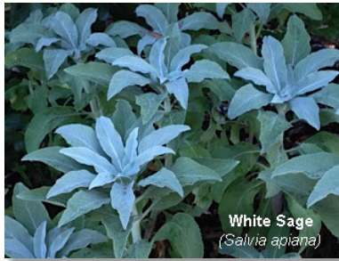
White Sage ( Salvia apiana )