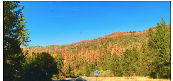
A view from Hwy 49, Mariposa County