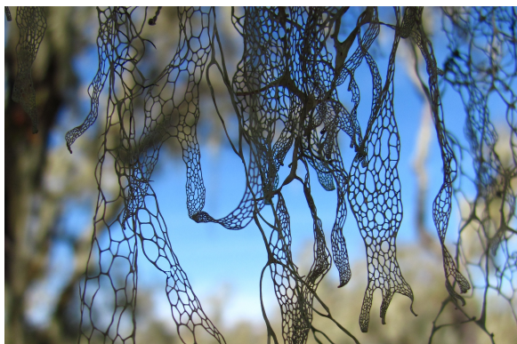
Ramalina menziesii Lace Lichen

But the other, sited on SC Edison property near a drainage, far enough from the road not to be affected by traffic, was a shock. This old giant, at least 150 feet tall and 4 feet across at the ground, and, based on ring counts of similar trees, at least 150 years old, has survived many drought cycles in the past -- but not this one.