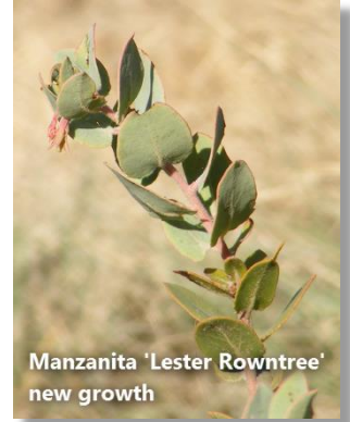
Manzanita 'Lester Rowntree' new growth