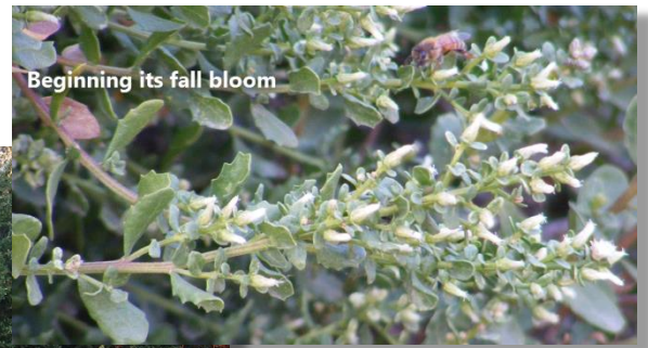
Beginning its fall bloom