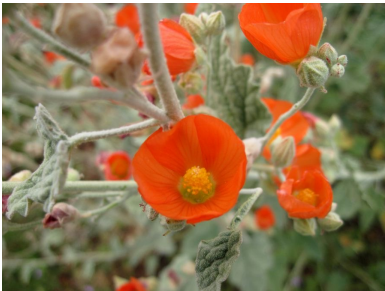
Apricot mallow

Madeleine Mitchell Madeleine43@comcast.net