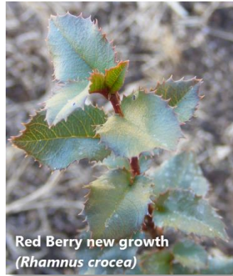
Red Berry new growth ( Rhamnus crocea )