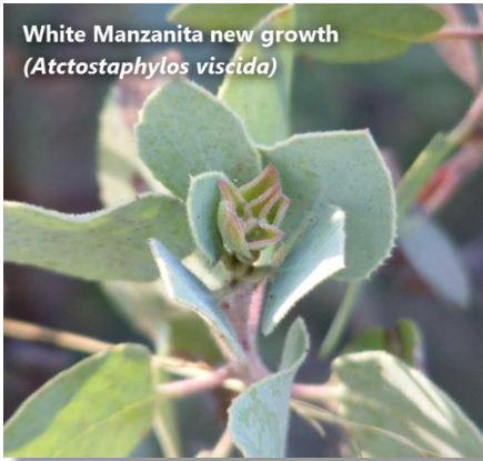
White Manzanita new growth ( Atctostaphylos viscida )