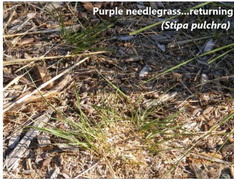
Purple needlegrass...returning ( Stipa pulchra )