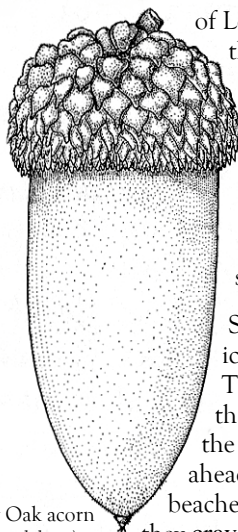
Valley Oak acorn ( Quercus lobata )

Also, on the same date, "UC MERCED TRIMS ITS EXPANSION PLANS, School will conserve more wetlands in bid for permit". UCM's new expansion plan preserves 330 acres of vernal pools east of the campus and 310 acres of open grazing land. Still 81 acres of wetlands will be lost, down from 121. That's a compromise that shows someone is at last listening.