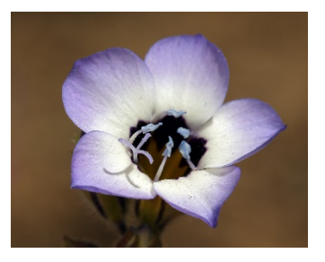
Gilia tricolor

When we moved to Fresno, going on 3 years ago, our new backyard had been nicely redone, with stamped concrete, a new sprinkler system, and a nice hybrid Bermuda lawn. Unfortunately most of the landscaping was pretty thirsty. We pulled many shrubs and trees and shut off the sprinklers, and among the plants we added to the perimeter beds were California poppies ( Eschscholzia californica ) and bird's eyes gilia ( Gilia tricolor ).