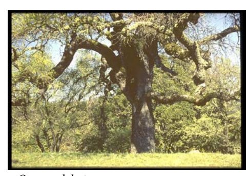
- \it Quercus lobata- \rm \hat{A} \odot Br. Alfred Brousseau, Saint Mary's College

We're looking forward to another great year, our thirteenth. In February (on the 18th, from 9-12), we'll be tackling those pesky rosettes again, maintaining the trail, and perhaps, dropping some dead Ailanthus trees. Please join us if you can. China Creek Park is located on the west side of Centerville, 16 miles east of Fresno on Highway 180. To get there, drive east on Kings Canyon/ Highway 180, 16.5 miles to Centerville. Turn right (south) on Smith Road and drive 0.2 miles to Rainbow Drive. Continue straight, 0.5 miles down the small road to the Park gate at the end of the road.