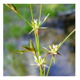
-Juncus bufonius-©2008 Zoya Akulova

Annual Grasslands is really a misnomer, as the forage crop of the open slopes is usually one-half forbs (broadleaves) and one-half grasses and grasslikes. The dry weight ratio can vary from 50/50 to 40/60 or 60/40. The broadleaves have more biomass than the grass (Poaceae Family), even though the grass appears denser.